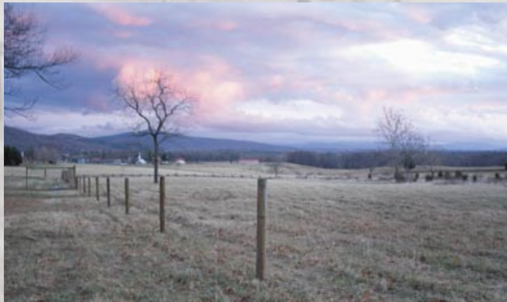
Bridget's sunset photo

We do our very best to keep accurate records and want to acknowledge your gifts. If we have made an error, please contact us so that we may correct this listing.