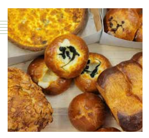
Some of the many delectable breads Roxanna learned to make at King Arthur