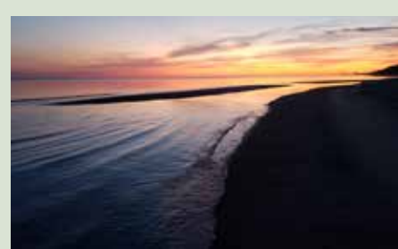
Indiana Dunes National Park