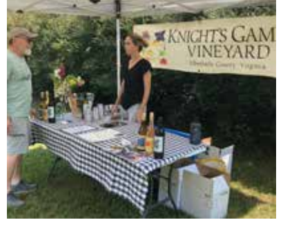
We love partnering with local businesses like Knight's Gambit Vineyards.