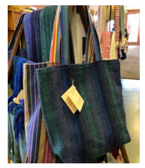
The weavery offers an assortment of colorful items at the craft fair.