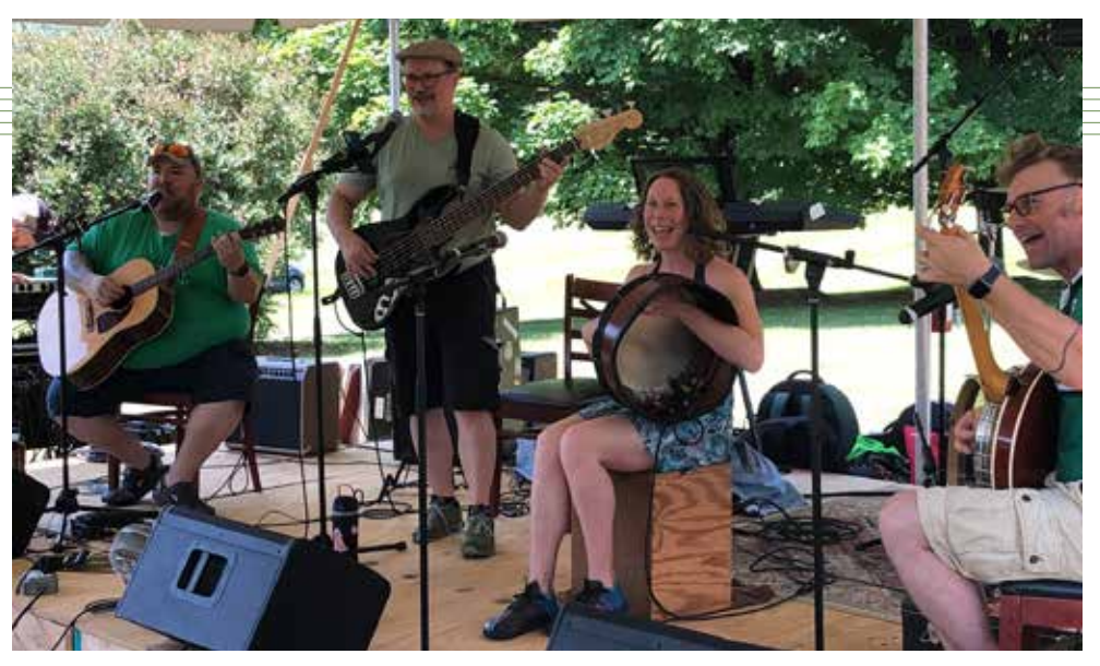
Grainneog opens up the festivities with our all-time favorite Irish tunes.