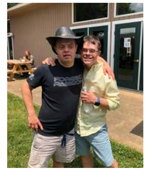
Best buds Max and Crosby enjoy a big hug.