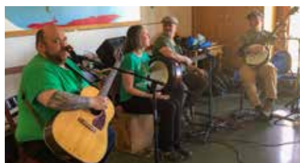
Without our favorite Irish band, Grainneog, our St. Patrick's Day celebration wouldn't be complete.