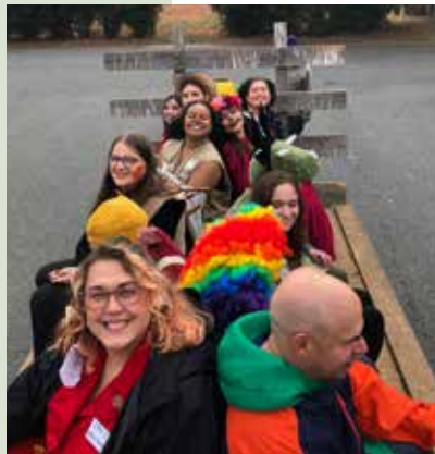
Everyone is all dressed up and ready for a hayride through the village.