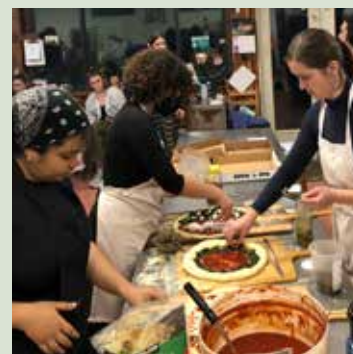
With so many tasty options and toppings, all hands are on deck to make sure that the houses get the right pizza orders.