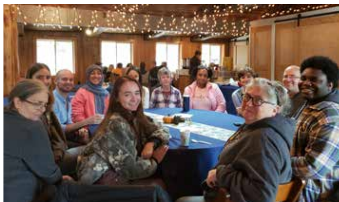
Our volunteers and staff enjoy some team building activities during our annual fall retreat at Montfair Resort.

There are so many new faces at Innisfree, as 2023 has welcomed 16 new volunteers! Spanning the globe, each volunteer brings a unique set of gifts and talents, valuable experiences, and a commitment to lifesharing. Our volunteers wear many hats each day, from companions and caregivers to mentors and friends, and it is through their contributions and generosity that we can continue to love and grow in a community full of beauty, warmth, and respectfulness. We look forward to all that 2024 brings with an incredible start to the new year as even more new volunteers continue to join us.