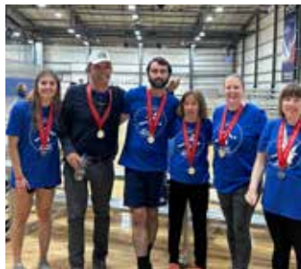
Innisfree participates in the Virginia State Games for Special Olympics with both bocce and pickleball.